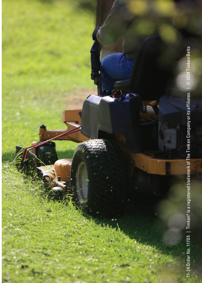
11-24 Order No. 11705 | Timken® is a registered trademark of The Timken Company or its affiliates. | © 2024 Timken Belts

With this partnership, the lawnmower manufacturer delivered on its promise of an extended warranty, a key differentiator in a highly competitive market. Furthermore, Timken Belts' commitment to timely delivery ensured that production schedules were not only maintained but optimized, allowing the manufacturer to avoid costly delays and seamlessly launch their new product line. Through this collaboration, the customer gained a substantial competitive edge, standing out in the market as a provider of long-lasting, dependable machinery.